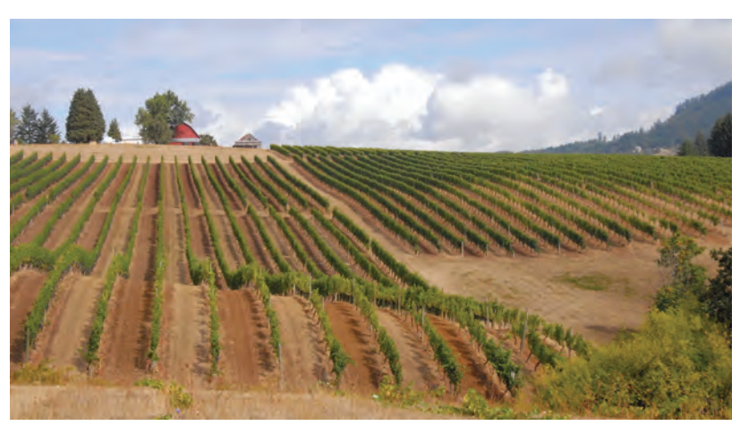
Ridgecrest Vineyards | Ribbon Ridge AVA | Willamette Valley | Oregon

When we first set foot on Ribbon Ridge about 40 years ago, we knew it was something special. There was an indefinable magic to the place, in the lowslung, rolling hills that rise and fall like the breath of a slumbering child. It was undeniably alive, and bursting with potential.