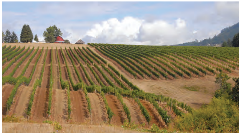
Ridgecrest Vineyards | Ribbon Ridge AVA Willamette Valley | Oregon

When we first set foot on Ribbon Ridge in 1980, we knew it was something special. There was an indefinable magic to the place, in the low-slung, rolling hills that rise and fall like the breath of a slumbering child. It was undeniably alive, and bursting with potential.